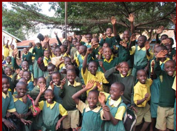
Thanks to the partnership's work, thousands of school children across Kenya have participated in HIV prevention and life skills classes that arm them with the information they need to stay healthy.